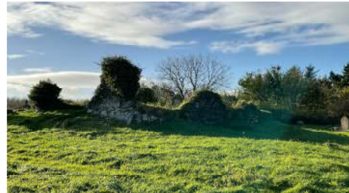
(Old Dunboe Church, founded by St Eunan(wrote the life story of St Columba))