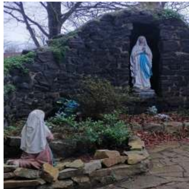
Loretto College Grotto

Parish Of Dunboe, Macosquin and Aghadowey Sunday 5 th December 2021 2nd Sunday of Advent